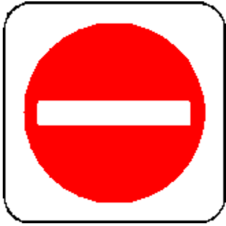
Do Not Enter