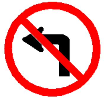
No Left Turn