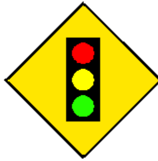
Warning: light will turn